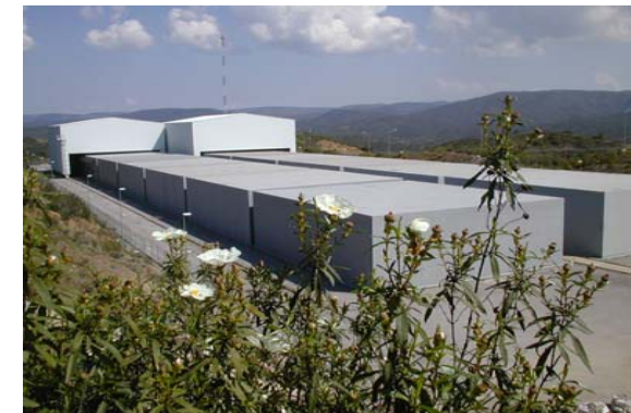
El Cabril, low and intermediate level waste storage facility in Spain.